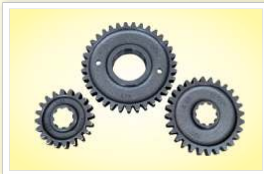
(7) SIDE GEAR SET