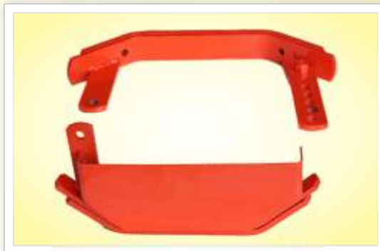
(3) DEPTH SKID SET