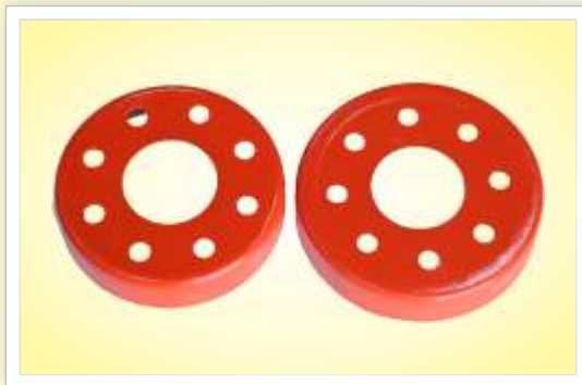
(10) DUST COVER SET