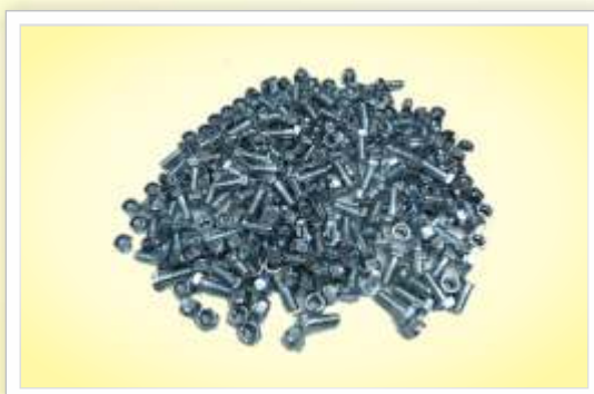
(14) BOLT KIT