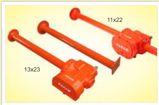
(8) MULTI SPEED GEAR BOX