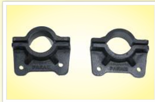
(9) PIPE CLUMP SET