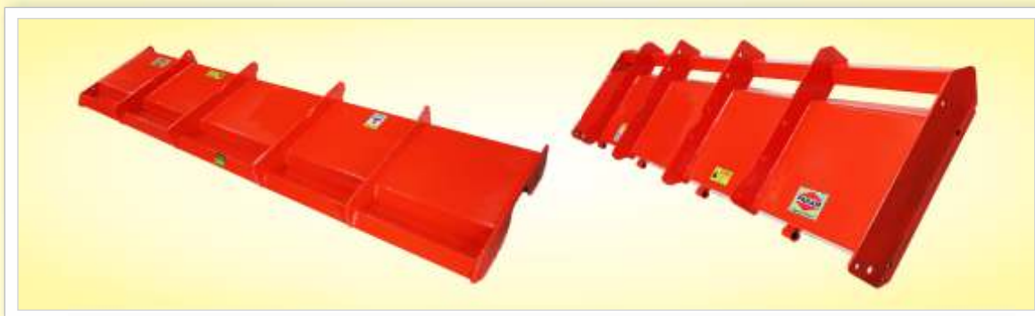
(1) ROTAVATOR BODY