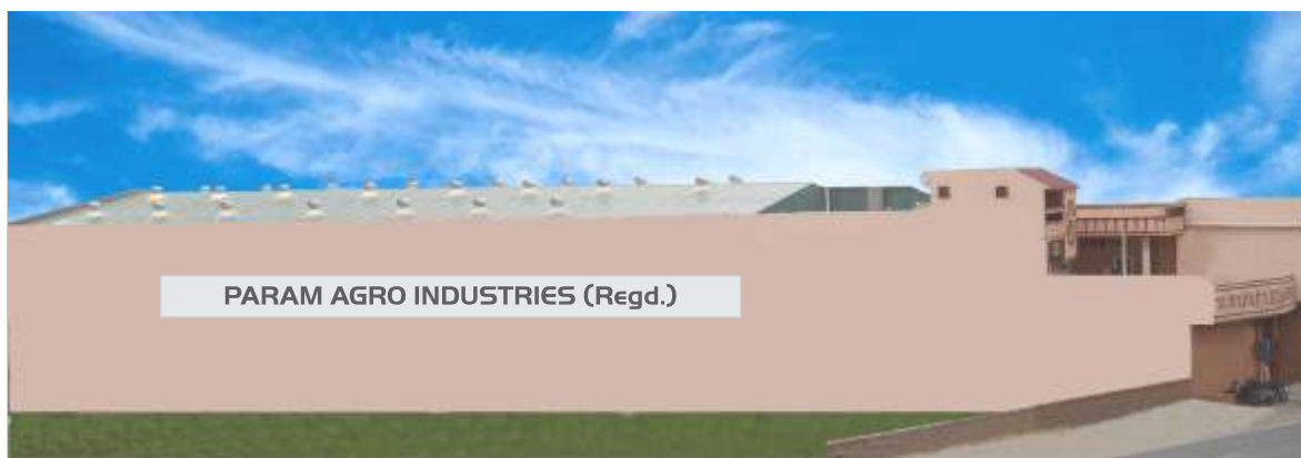
PARAM AGRO INDUSTRIES (Regd.)