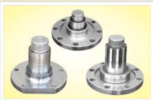
(6) AXLE SET