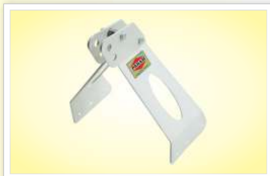
(19) TOP FRAME SET