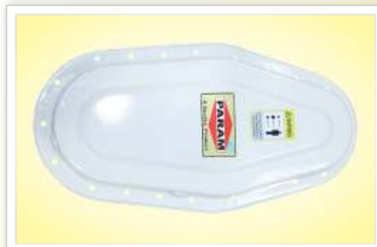
(13) SIDE COVER