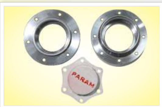
(4) HOUSING SET