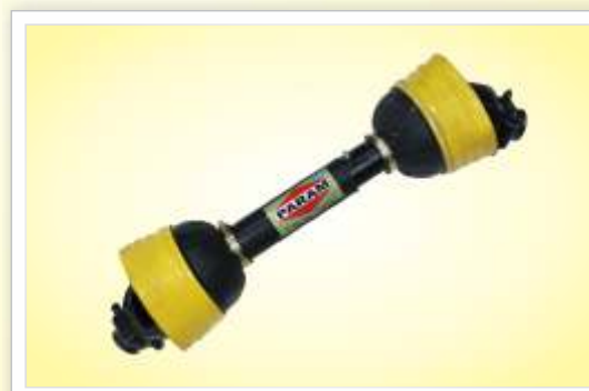
(22) PTO SHAFT