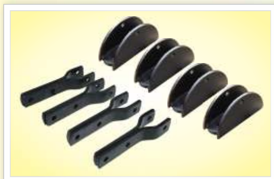
(17) Z & U CLUMP SET