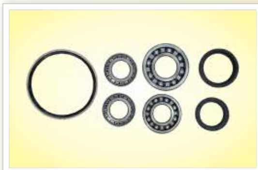
(5) OIL SEAL AND BEARING SET