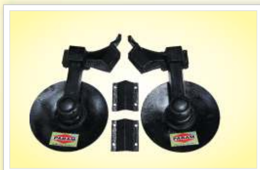
(21) DISC SET