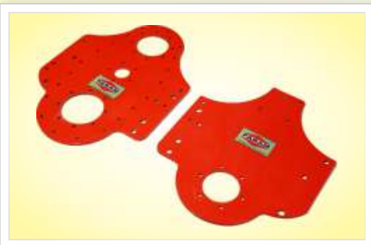
(2) SIDE PLATE SET