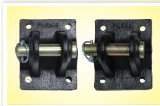
(20) LINK SET